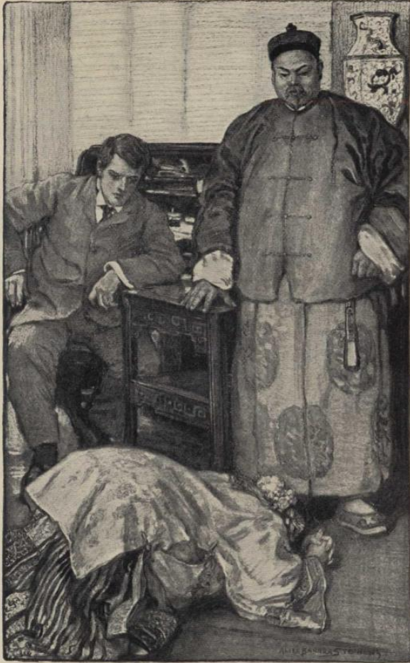
The girl threw herself on the floor Page 55